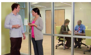
"Would you look at those two?"