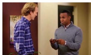
"Catch the game last night?"