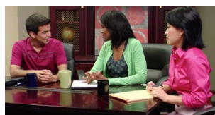
"I've heard he's one of the best."