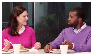
"Just deal with it."